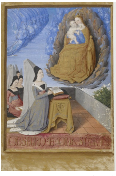
Figure 3: Anne in prayer, The Hours of Anne de Beaujeu-Amplepuis, Paris, BnF, ms. Nal 3187, fol. 8r

ligious artworks in a prolonged gaze.17 Unlike commoners who only occasionally were able to view lavish rituals, for example, when there was a formal entry by a ruler into a city, which was accompanied by ceremonies and festivals,18 nobles could develop refined tastes for visual images as they engaged with the arts daily. Sumptuous objects that artisans produced for court audiences created spectacles for which appreciation and interpretation demanded intent gaze. The style of painting north of the Alps promoted this approach as it displays an