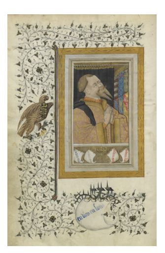
Figure 1: René of Anjou Praying to Christ, The Hours of René of Anjou , Paris, BnF, ms. Latin 1156 A, fols. 81v

The three portraits discussed herein were created in the 1430s to 1480s by different artists and in different French regions. René I of Anjou (1409-1480) is depicted in a close-up praying to the suffering body of Christ on the right-hand folio, who is held by a mourning angel (fig. 1, Paris, BnF, ms. Latin 1156 A, fol. 81v).13 René was an art lover who was known for his patronage as well as for his interest in the art of painting. Christian de Mérindol and others argue that the duke was involved in the production of the manuscript, if not as one of the illuminators, then as a patron.<sup>14</sup> The second prayer book, which was