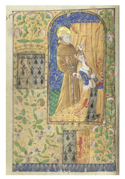
Figure 1: René of Anjou Praying to Christ, The Hours of René of Anjou , Paris, BnF, ms. Latin 1156 A, fols. 81v

Dafna Nissim, The Emotional Agency of Fifteenth-Century